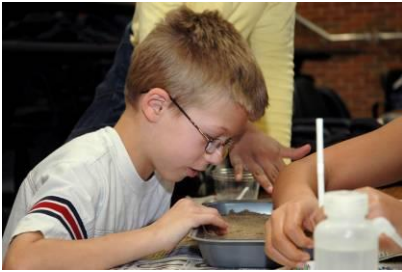
Students having fun!