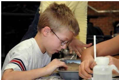
Students having fun!