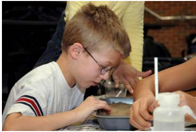
Students having fun!