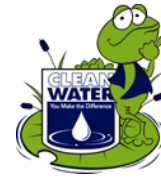
Clean Water Clyde